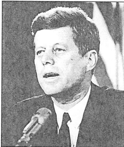
Contradiction: Despite professing Roman Catholicism, Kennedy once told journalist Benjamin Bradlee that "he was all for people solving their problems by abortion."