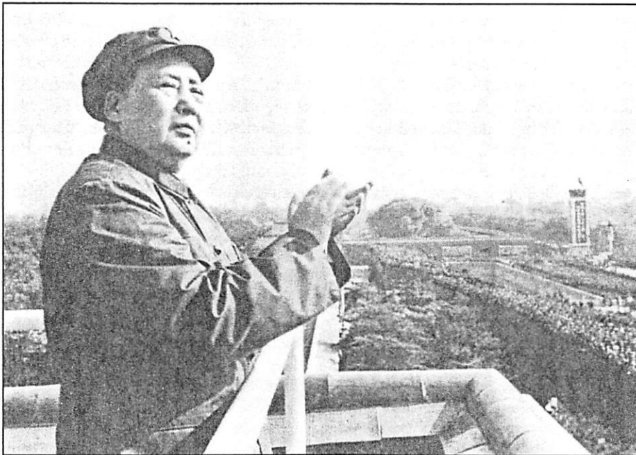
The materialistic state: Totalitarians like Mao believe they own the lives of their subjects, and dispose of them as they see fit. China's masters today control population through forced abortion.

In 1962, as the American Law Institute (ALI) debated a model statute intended to guide "reform" of state abortion laws, attorney Eugene Quay summarized the constitutional case against abortion: "The state cannot give the authority to perform an abortion because it does not have the authority itself. Those lives are human lives, and are not the property of the state." The 1973 Roe deci-