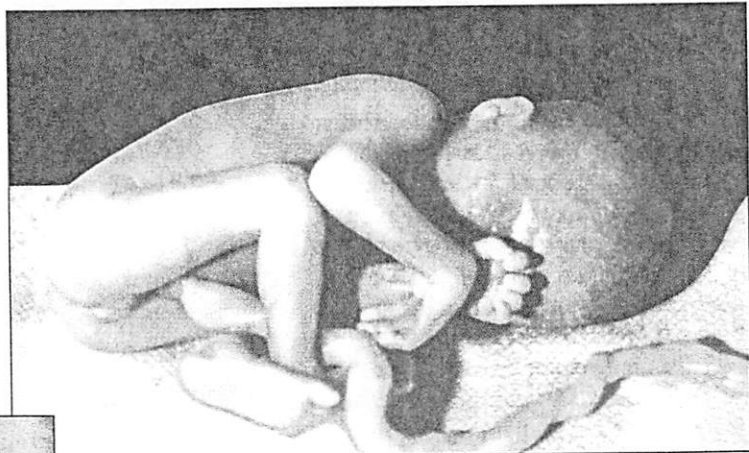
Hayes Publishing Co.