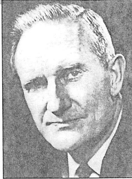
Planned Parenthood progenitor: Pro-abortion crusader Margaret Sanger (left), a member of the American Eugenics Society, founded the Birth Control League in 1916. She and her organization acted as a liaison between “street-level radicals” and “silk-hat” Eugenics Society members like J.D. Rockefeller III (right), his grandfather, and George Eastman of Kodak camera fame. Now named Planned Parenthood, the organization is a major abortion advocate and provider.

sion, by invalidating all existing state laws against abortion, was built upon the same premise expressed by Romanian despot Ceausescu, namely that the unborn child is disposable property over which the central government has total authority.