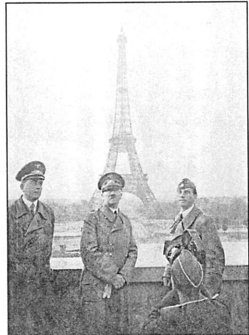
Birds of a feather: Hitler and his Nazi regime were embraced by Margaret Sanger and the American eugenicist movement. Likewise, der Führer was a fan of the American Eugenics Society.

With diabolical guile, Sanger used the social upheaval fomented by her radical comrades to illustrate the supposed need for totalitarian population control measures. In 1931, following a march by radicals on the nation’s Capitol, Sanger told George Eastman (one of her chief financial angels) that “the army of the unemployed — massed before the Capitol yesterday morning — reminded one very forcibly that birth control in practice is the only thing that is going to help solve this economic ... problem.” In 1932, Sanger pro-